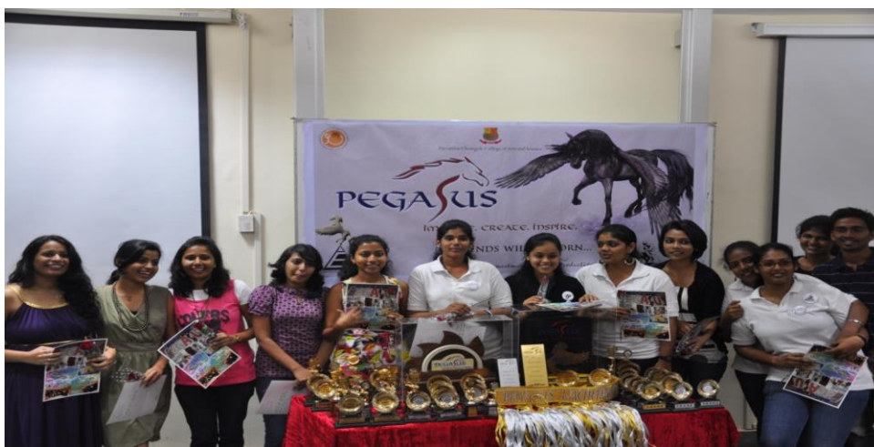
Pegasus Intercollegiate English festival