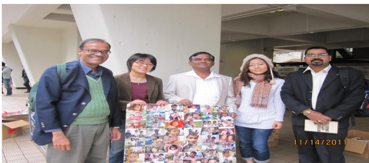
Faculty Members at JALT Japan.