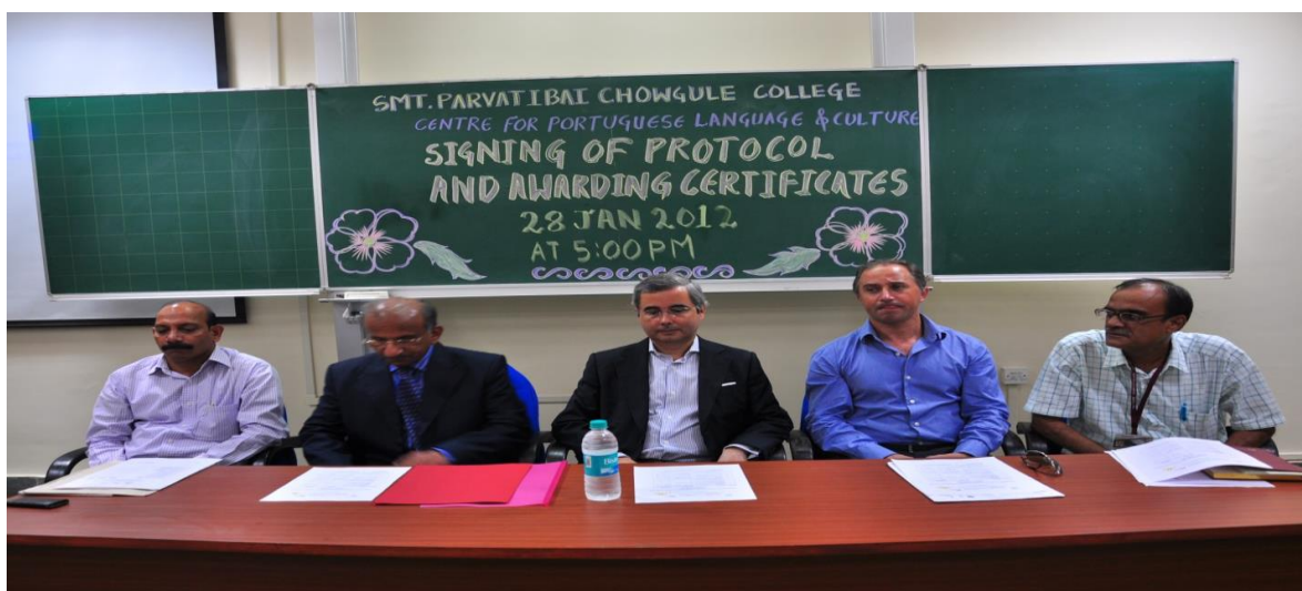
Signing MOU with Centre for Portuguese Language and Culture