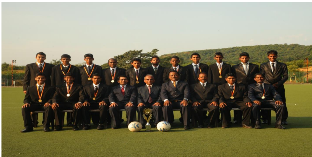
Winners of Intercollegiate sports event.