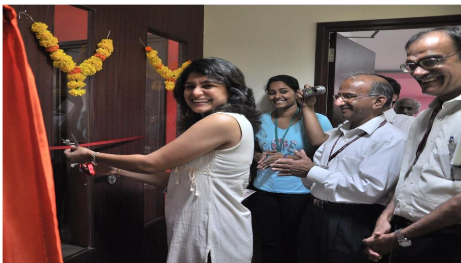
Inauguration of the Student Support Centre.