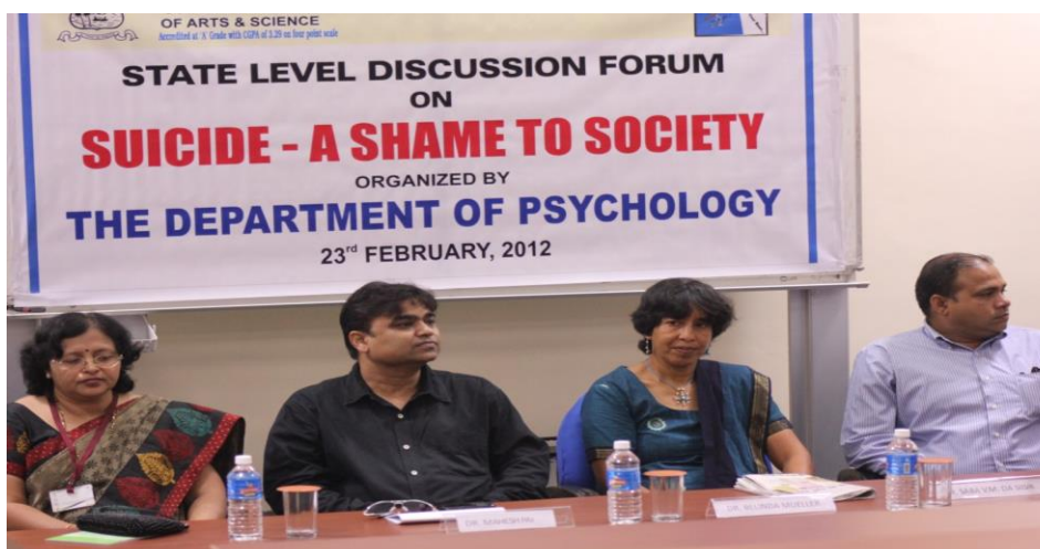
State Level Discussion Forum