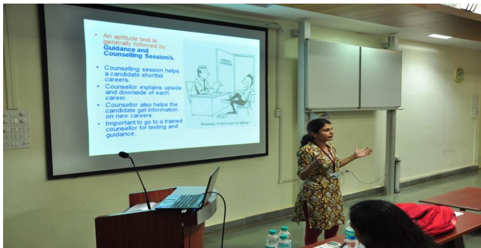
Workshop on "study skills and careers" counseling